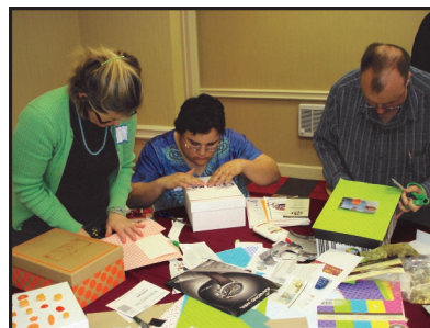
One conference activity was decorating boxes to express each advocate's personality.