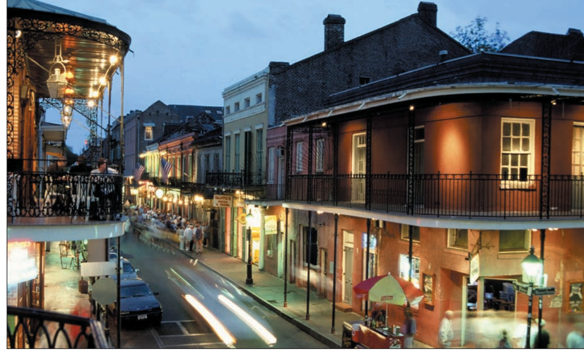
Bourbon St., New Orleans

The roads to America's South are paved with history. In grand cities such as Charleston, South Carolina, where horse-drawn carriages pass centuries-old mansions, you can at times feel as though you've been transported in time. In Savannah, Georgia, over half of the 2,500 buildings have architectural or historic significance. Stroll the streets of New Orleans' French Quarter and you'll discover a unique neighborhood of a bygone era. The timeless beauty of these cities is legendary.