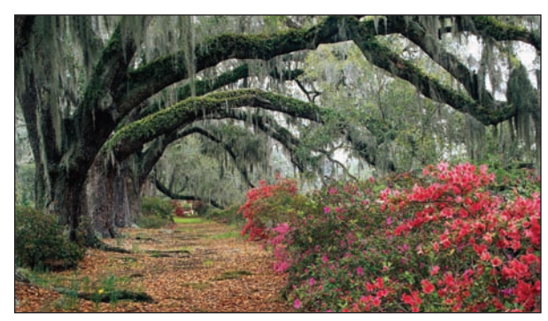
Magnolia Plantation in Charleston, South Carolina

One of the best ways to acquaint yourself with Charleston is to walk the streets of the downtown area. Many of the historic district's pastel-painted homes, B&Bs, restaurants and shops are located here. The historic district encompasses more than 2,000