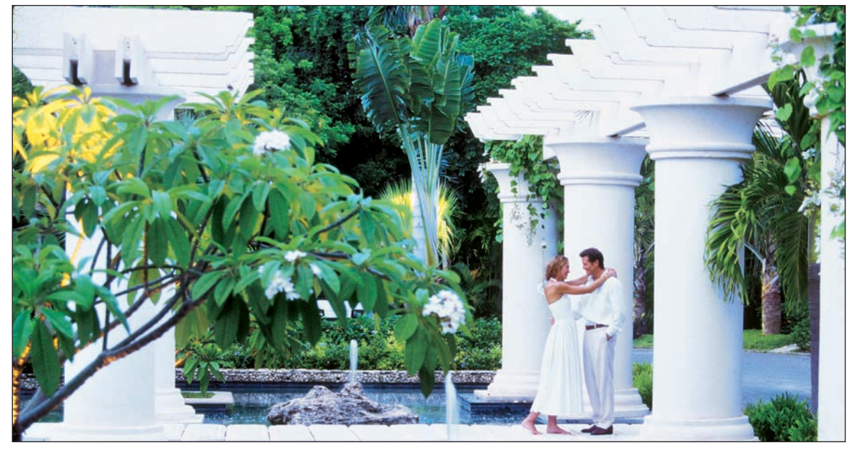
Honeymooners in Punta Cana

A honeymoon should be the most extraordinary vacation of your life, filled with memories you will cherish forever. So don't run to the altar before stopping to truly consider that perfect honeymoon escape once the vows have been recited.